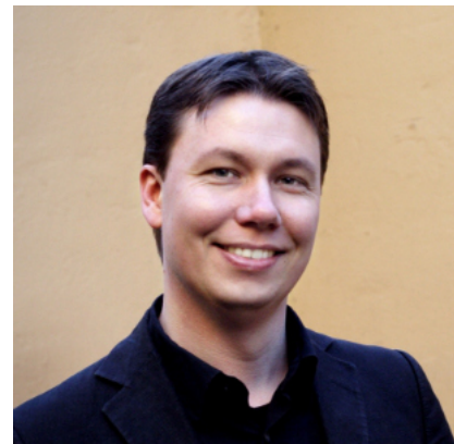
Ola Gjeilo (b. 1978)