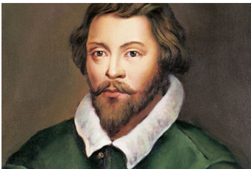
William Byrd (c. 1540 – 1623)

O great mystery, And wonderful sacrament, That animals should see the newborn Lord, Lying in a manger! O blessed virgin, whose womb Was worthy to bear The Lord Jesus Christ. Alleluia!