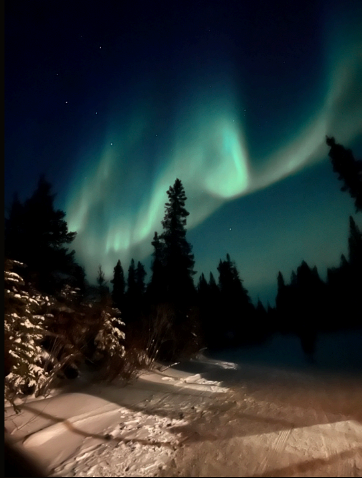
Aurora